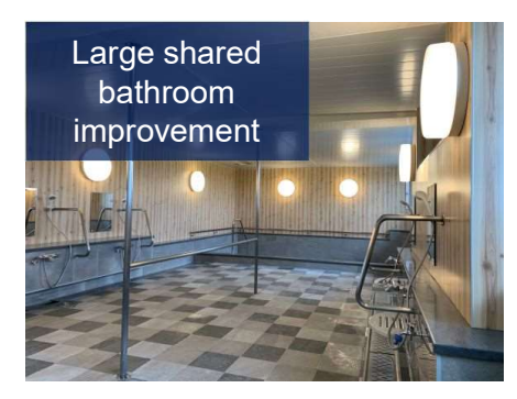
Completed critical improvement to healthcare facility amid the COVID-19 pandemic while maintaining operations

Note 1: The World Health Organization (WHO) and the United Nations define a "super-aged society" as a society in which more than 21% of the population is 65 years or older. Note 2: Estimated market share is calculated by dividing KDR's AUM by J-REIT Healthcare market size as of the end of september 2023.